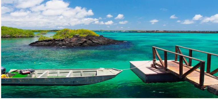
Santa Cruz Island