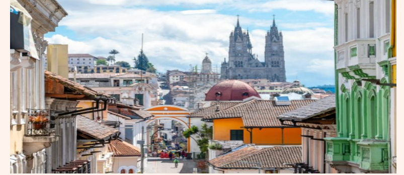
Tour of Quito