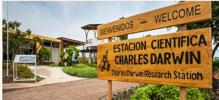
Charles Darwin Station