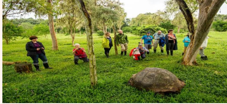
Tortoise Natural Reserve